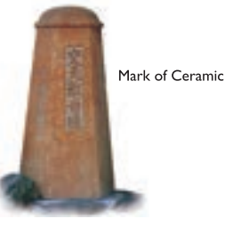
Mark of Ceramic

This ancient street continues stretches from Shigaraki station square to Tosei-cho and Yakiya-cho. It is believed that pottery first began in this area at Tosei-cho. The name Tosei-cho literally means 'pottery came from here' in Japanese. The name Yakiya-cho refers to the kilns used to make the pottery.